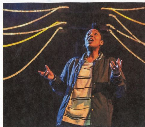
Cookies performed in the West End in 2017