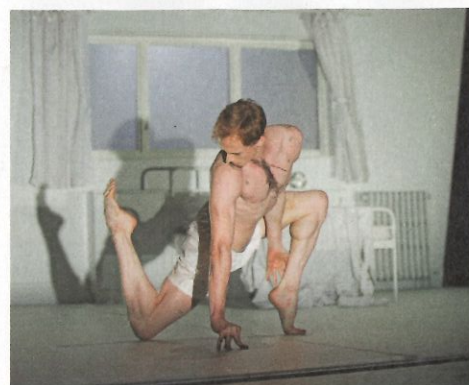
Edward Watson in The Metamorphosis