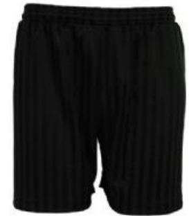
Shadow Stripe Shorts