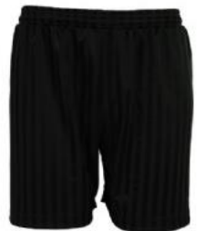
Shadow Stripe Shorts