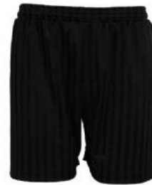
Shadow Stripe Shorts